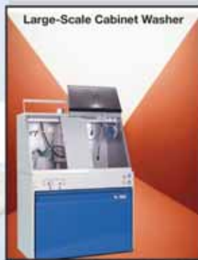
Large-Scale Cabinet Washer