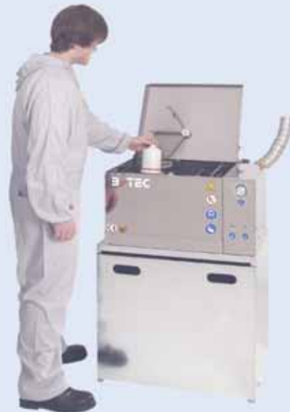
Optional: Base Cabinet