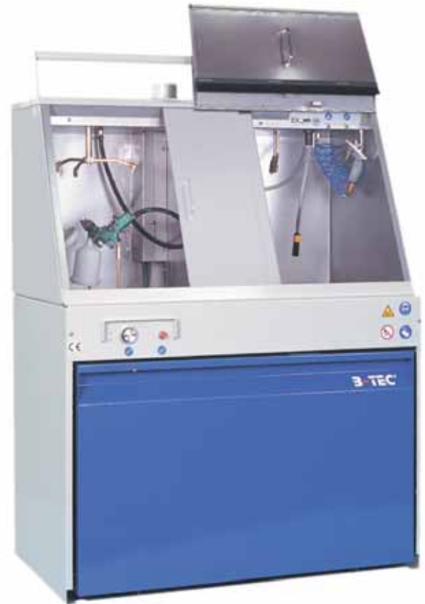
Optional: Drip protection tray